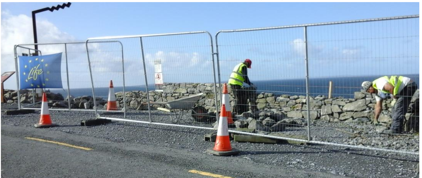
Below: Work to the wall at Murrooghtoohy