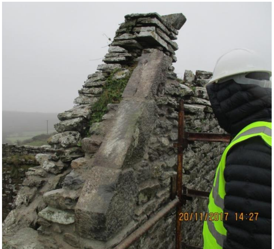
Right: picture after the completion of the works