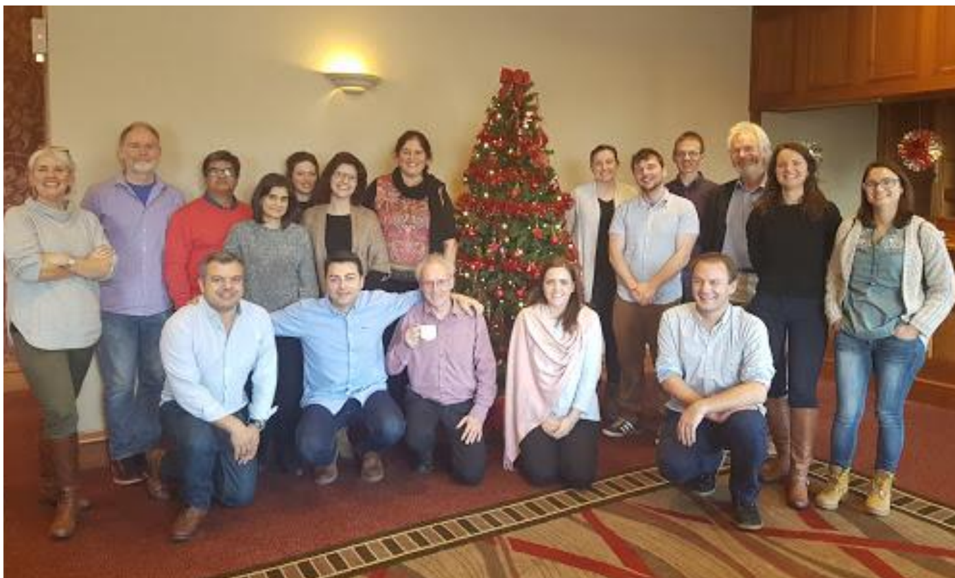
Above: members of the North Atlantic Geopark Route programme at the Falls hotel, Ennistymon during their study visit to the Geopark

The group with representatives from all thirteen partners visited our Geopark for a study visit and co-ordination meeting in November. The group looked at the GeoparkLIFE project and explored the promotional opportunities, networking and IT infrastructure options the project could develop.