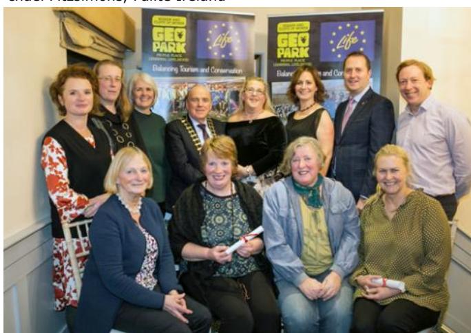
Members of The Burren Food Trail who won the award for a group working together.