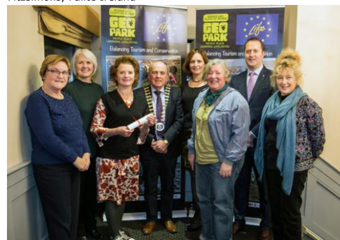
Members of the conservation Advocacy committee who won the award for A Cared for landscape.