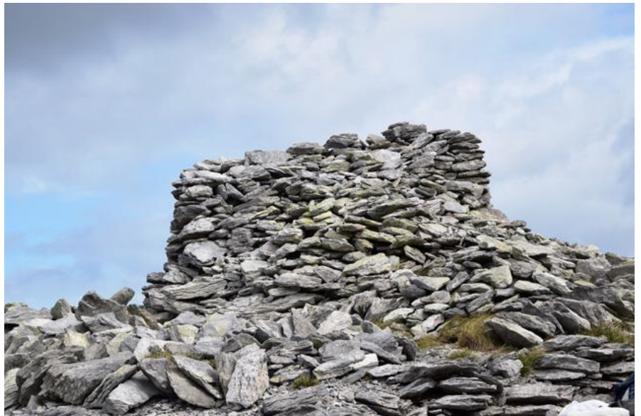
Top and above: Some before and after pictures of the conservation works to the 19th Century cairn at Murrooghkilly (Blackhead)