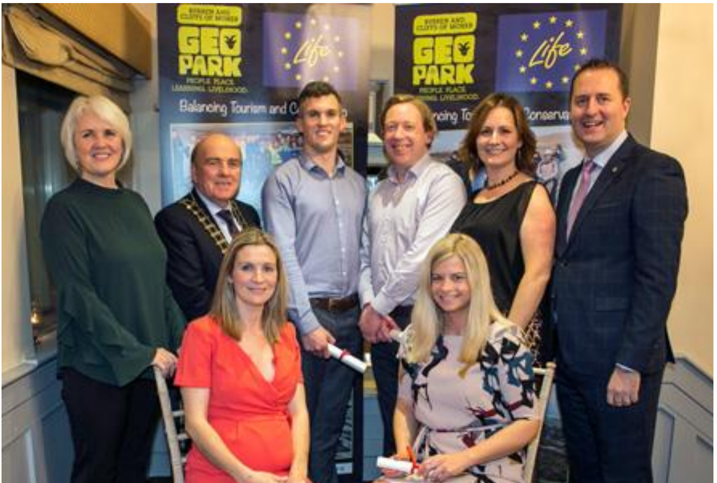
Above the team at Hotel Doolin who were big winners on the night taking home 4 awards including the big prize of Sustainable Tourism operator of the year.