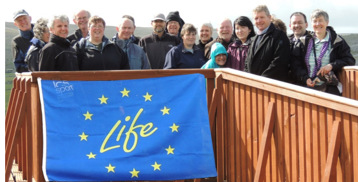
GeoparkLIFE partners on a site visit to An Cahermor.