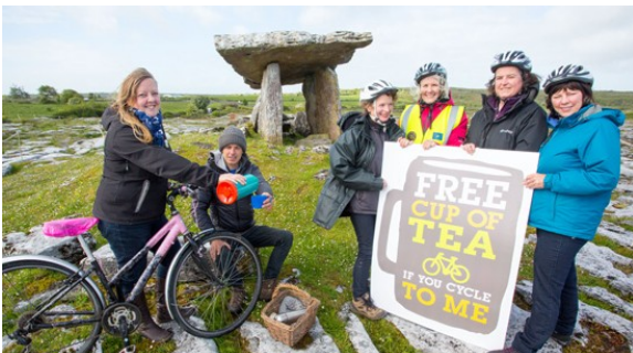
BEN Sustainable Transport Committee launching Free cup of Tea initiative

For further information on the Burren Ecotourism Network you can follow them on Facebook https://www.facebook.com/burrenecotourism and Twitter https://twitter.com/BurrenEco