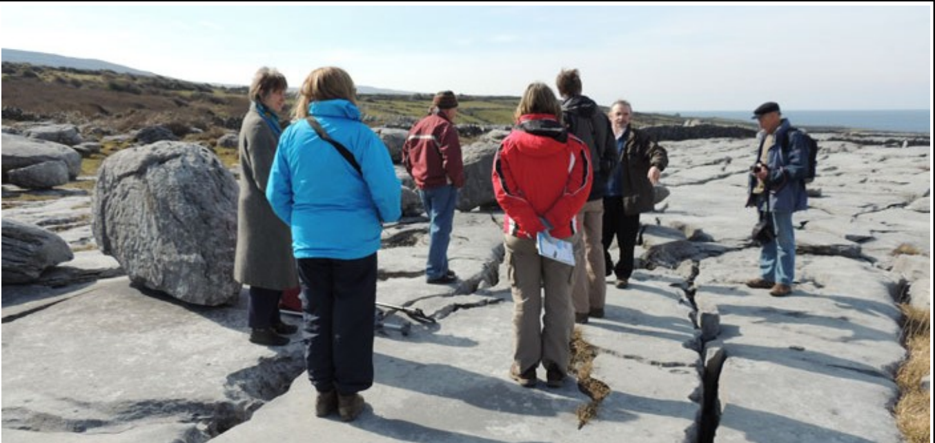
Learning in the landscape