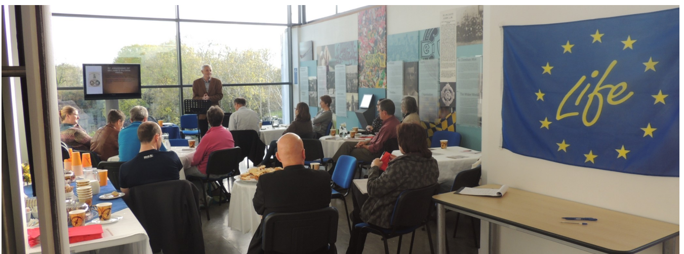
GeoparkLIFE partners attending a training session on pilgrimages to gain an insight into visitor behaviour

The focus of this work is to enable the continuation of public access, while maintaining the integrity of these heritage sites and monuments. Access to heritage sites is incredibly important not just in the Burren but in destination across Ireland and in Europe and the model and toolkits we develop for the management of these sites will be transferable to other regions. As we progress through the project we will update you on our findings and the solutions for each of the sites in future newsletters.