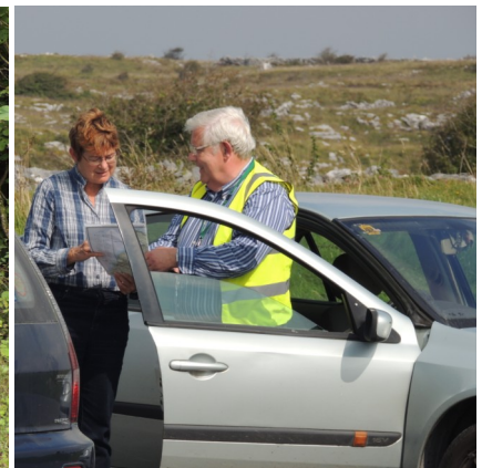
A visitor survey was undertaken at the seven demonstration sites to gauge feedback on the ease of access and facilities available

Each site is being assessed for its infrastructure, access, visitor numbers, usage patterns and heritage presentation. We are also reviewing how the site are managed, as well as monitoring the impact of visitor footfall and behaviour. Through the accumulation of all this information, we have identified sensitive pressure and impact points at each of the sites and are creating work programmes to address these.