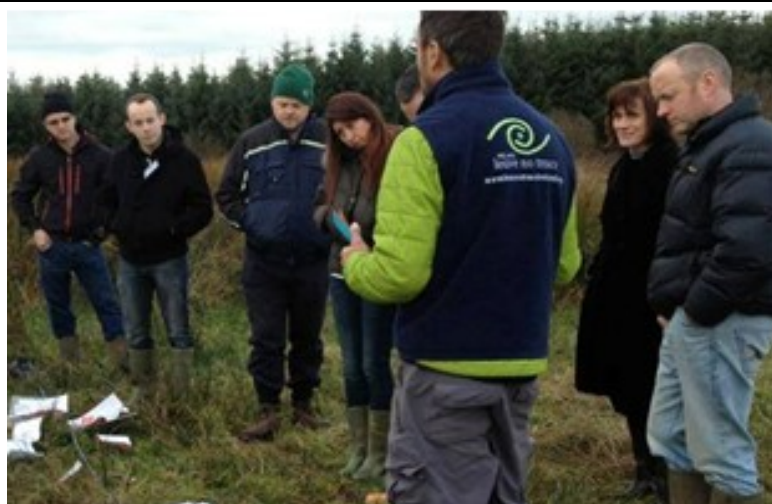
Left: Burren Ecotourism Network members out in the landscape learning about 'Leave No Trace' principles.