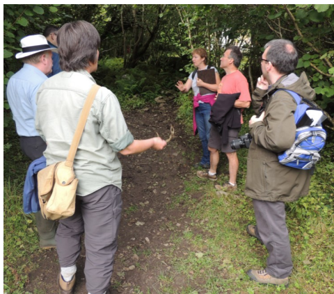
The assessment of Slieve Carran also includes the monitoring of the impact of visitor footfall on the ecology and geology of the site.