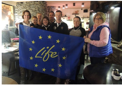
Members of the Burren Ecotourism Network during sustainability Training

Featuring 10 key areas of good practice the Code addresses both operational and visitor management practices of tourism businesses. Energy, water, waste-water and waste management are all ad-