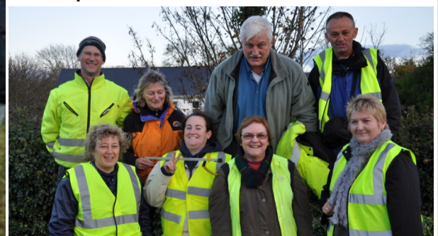
Below: Network members participating in a litter clean up