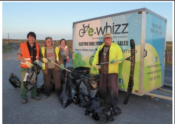
Burren Free Range Pork, Kilfenora Hostel and e-Whizz in Kilfenora with their collected waste

The initiative was conceived by members of the Burren Ecotourism Network and through GeoparkLIFE, it is supported by Clare County Council. Through the initiative members of the network take responsibility for a section of hedgerow near their business premises, ranging from 500m to 3km. Each business is responsible for clearing the hedgerow of litter and reporting on invasive species such as Japanese Knotweed, Giant Hogweed and Dogwood, which negatively impact on native species that are part of the Burren ecosystem. The first clean up took place over a weekend in May 2015 and further dates are in planning.