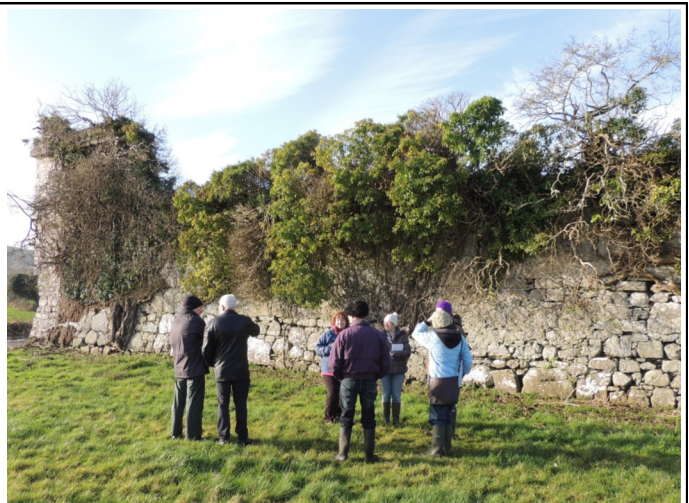
A site visit at An Cabhail Mhór

Notification has also been made to the National Monuments Service to carry out the conservation work and permission has been granted. The next step in the process is to commission a conservation engineers report and develop a training plan based on this. It is hoped that training will commence in Spring 2016.