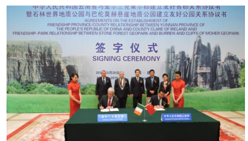
The Burren and Cliffs of Moher Geopark was twinned with the Stone Forest Geopark (Shilin Geopark) in Yunnan Province, China earlier this year.