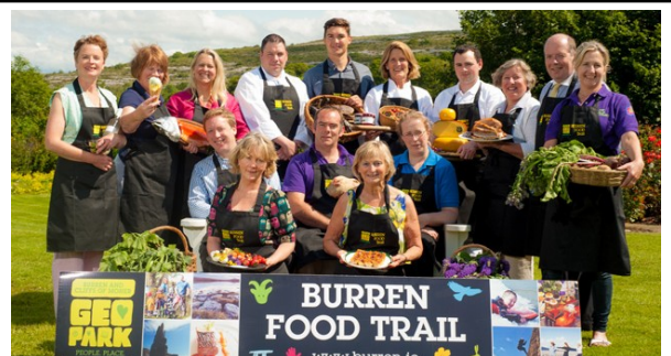
The Burren Food Trail

The region is now home to a European Destination of Excellence (EDEN) designation for Tourism and Local Gastronomy . The designation was awarded to the Burren Food Trail for demonstrating that local gastronomy has taken a central role in the tourism offering in their destination while also sustaining the local environment. Key to securing the win was the adoption of the Geopark Code of Practice for Sustainable Tourism by the businesses involved in the Burren Food Trail and their commitment to taking care of their environment.