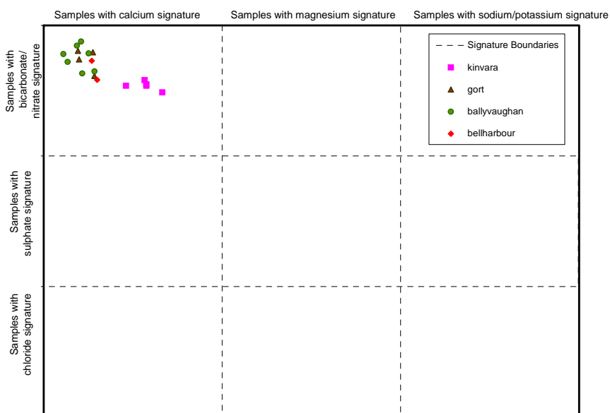
Chemical Signature of Relatively Uncontaminated Waters (expanded Durov Plot)