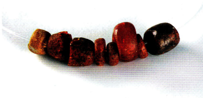
Figure 4. Amber beads (T. Kahlert)

to have been deliberately placed under a flat stone with a certain degree of care.