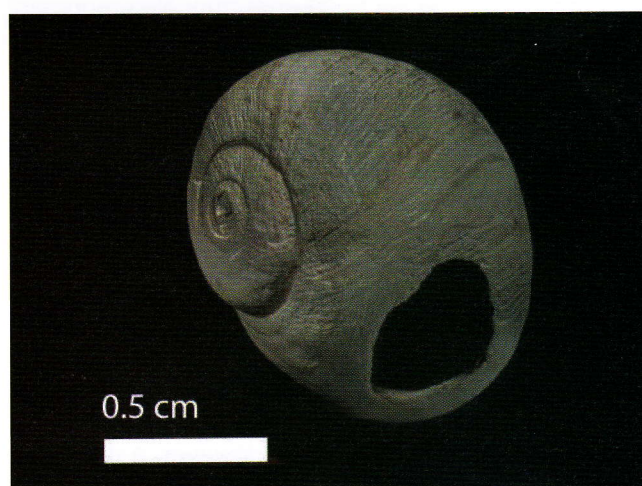
Figure 3. Perforated periwinkle (T. Kahlert)

The area immediately inside the cave entrance was occupied during the Early Medieval period and the platform outside seems to have been used as a working area. A series of limestone blocks were neatly fitted across the cave entrance and it is possible that they functioned as a plinth for a wooden door, particularly as an iron barrel padlock key was discovered inside