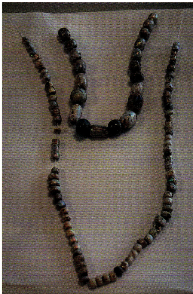
Figure 5. Viking glass beads (T. Kahlert)

In the same part of the cave where the Late Bronze Age burial was located, a Viking necklace of almost 70 glass beads (fig. 5) was recovered. The necklace can be dated to the mid 9th century AD. A large proportion of the beads were segmented and covered with gold foil. Similar beads are known from Viking burials at Kilmainham, Islandbridge and Fishamble Street, Dublin as well as from the Viking trading site of Birka in Sweden. In Scandinavia, these necklaces are associated with Viking women where they represent status, prestige and sometimes religious affiliation. The nearest Viking settlement is at Limerick and the necklace most likely found its way to the Burren via trade between Limerick Vikings and local wealthy Gaelic