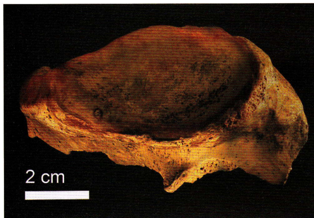
Figure 2. Bear scapula

yet clear. Certainly it served as some form of ritual monument, perhaps marking the transitional point of the cave where the inward sloping passage terminates and the flat cave floor begins. The human mandible found in 1986 was discovered within the wall of this cairn in addition to two human clavicles (shoulder bones). On the cave floor, directly beneath the cairn, a concentration was discovered including a shale axe, a rubbing stone, a copper-alloy object, a net sinker, three bone beads, three perforated cowrie shells, a perforated periwinkle (fig. 3) and an unperforated periwinkle shell and 42 amber bead fragments with a few complete beads (fig. 4). Amber is a relatively rare find and, coupled with a probable Baltic origin for the beads, suggests that Glencurran Cave was used by high status members of the community. Intermingled with the artefacts were 17 human bones representing two adults; one bone produced a Middle Bronze Age date of 3035 \pm 36 BP (UB-6660). Animal bones from this area represented four sheep (most under 6 months), two cattle and two pigs. Some bones were scorched and bore butchery marks.